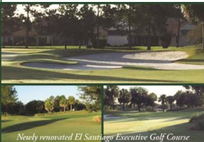
Newly renovated El Santiago Executive Golf Course