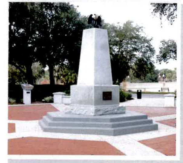
THE VETERANS MEMORIAL PARK OF THE VILLAGES, INC FLORIDA

DEDICATED ON NOVEMBER 11, 1998 TO ALL US VETERANS PAST AND PRESENT