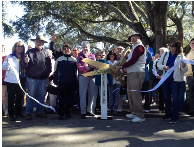
Paradise Park "Area A" Grand Opening Was held exactly one year prior – January 23, 2014