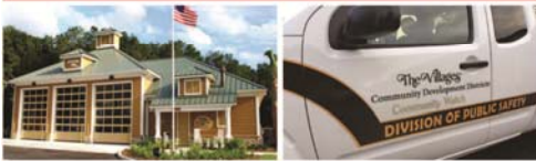
YOUR LOCAL GOVERNMENTS IN ACTION