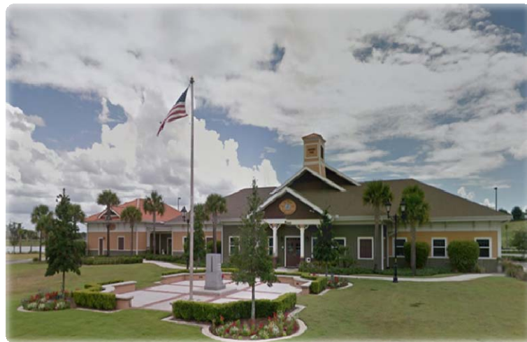
Villages Public Safety Department Fire Headquarters