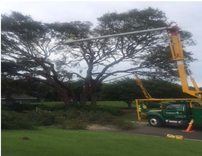
Tree work at Saddlebrook that took place June 12 th through 14 th

Executive Golf is taking full advantage of the bi-weekly course closure times to ensure the sustainability of the executive golf courses. These closures allow courses to recover and give contractors an additional opportunity to complete necessary maintenance work that could not take place without golfer inconveniences.