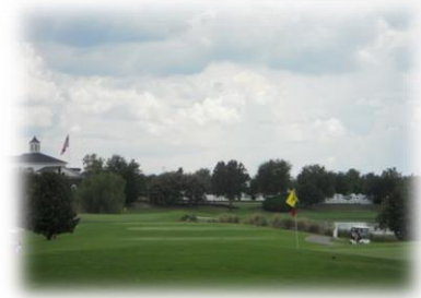
Executive Golf Courses