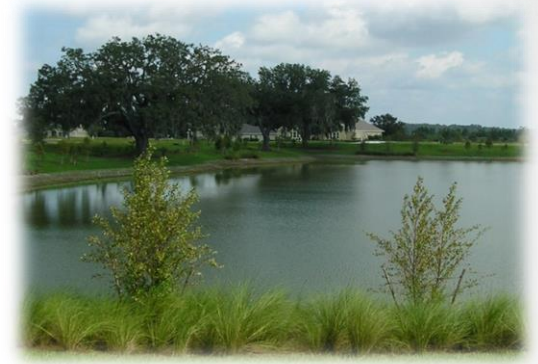
Water Retention Areas