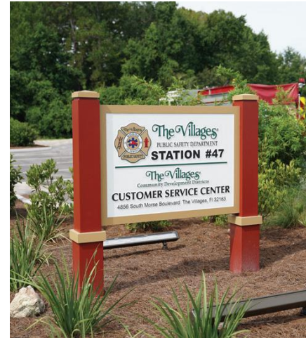
4856 South Morse Boulevard