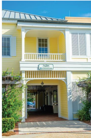
984 Old Mill Run