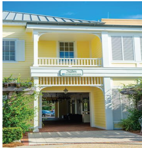
984 Old Mill Run