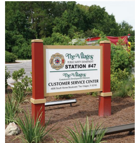
4856 South Morse Boulevard