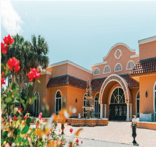
1200 Avenida Central