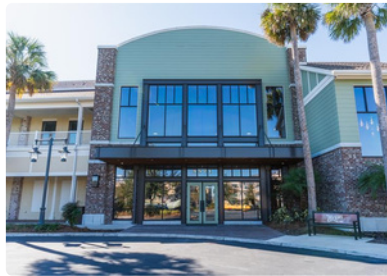
District Customer Service Center