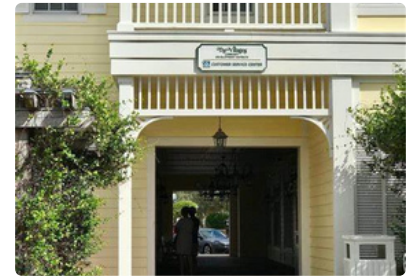
Lake Sumter Satellite Office