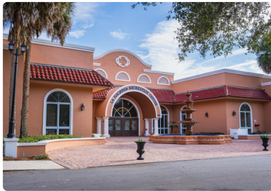
North Satellite Office

The Sumter satellite office opening has been delayed. The Lake Sumter Landing satellite office will temporarily be located at 984 Old Mill Run.